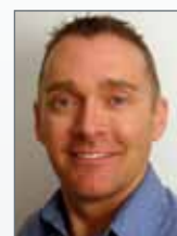
Paul Dillon Drug and Alcohol Research and Training Australia

There is a great deal of mythology around drugs and their use. This presentation will give accurate, up-to-date information on what we know about young people, alcohol and drugs in Australia. It will empower parents with basic information about current trends in alcohol and other drugs. It will help them to have meaningful conversations with their child and develop strategies to minimise the harms and risks associated with drugs and alcohol.